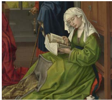
Rogier van der Weyden The Magdalen Reading , 1435