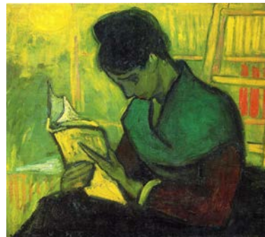
Vincent Van Gogh The Novel Reader , 1888