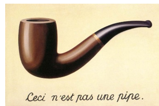
René Magritte The Treachery of Images, 1928