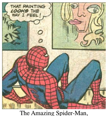
The Amazing Spider-Man, Issue # unknown