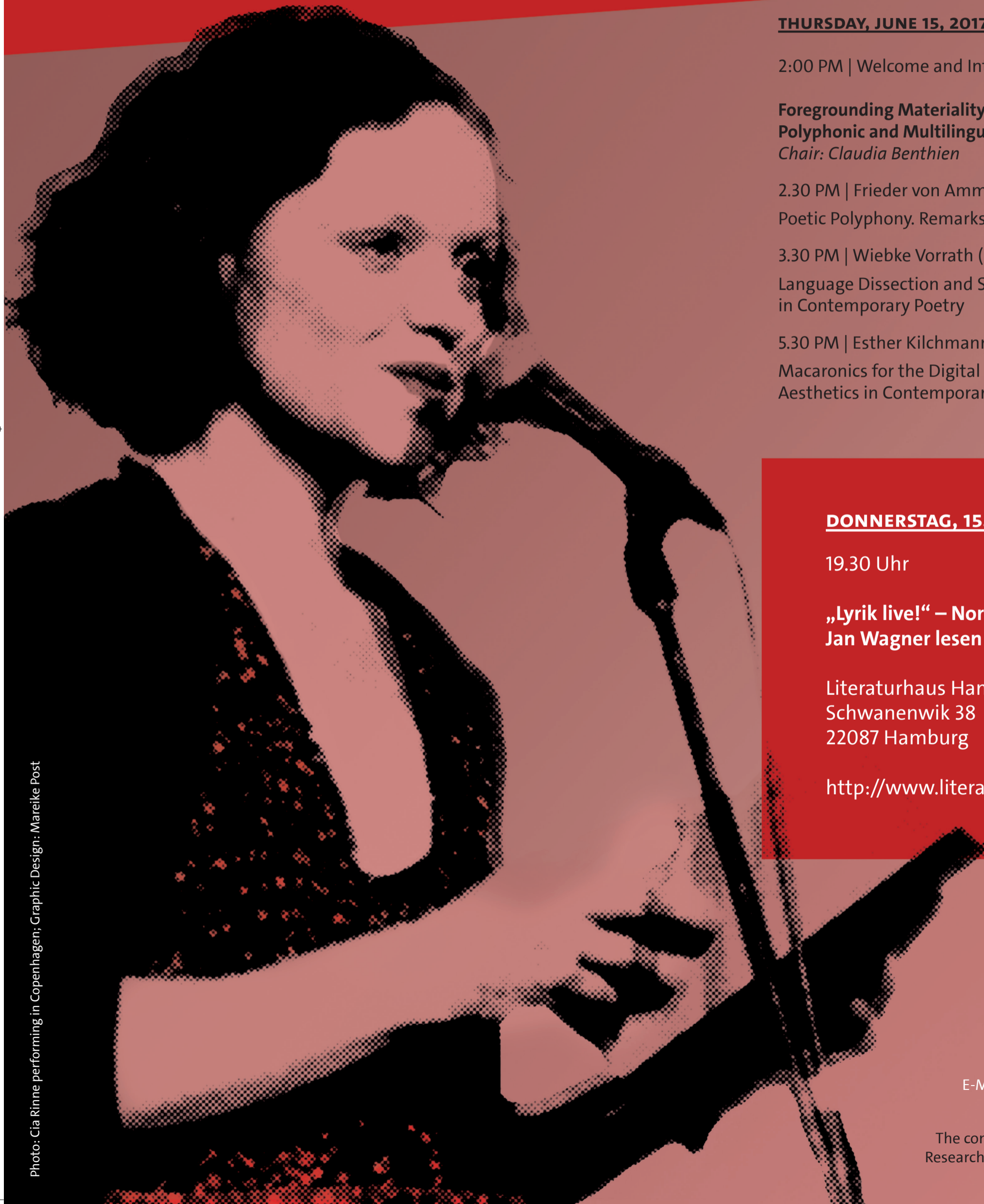
Photo: Cia Rinne performing in Copenhagen; Graphic Design: Mareike Post