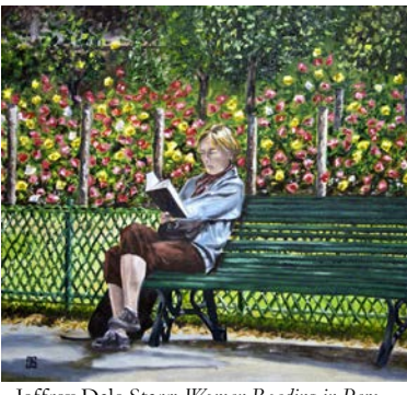
Jeffrey Dale Starr; Woman Reading in Parc Monceau, 2012