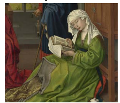
Rogier van der Weyen The Magdalen Reading, 1435