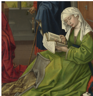
Rogier van der Weyen, The Magdalen Reading , 1435