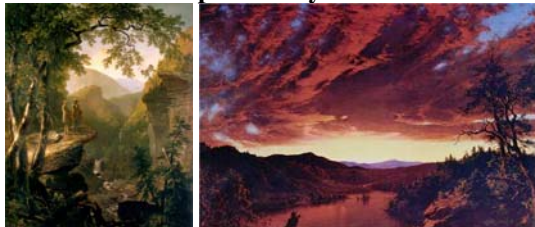
Landscape: The Eye and the I