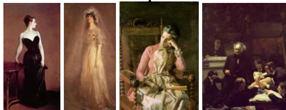
Portraiture: From Representation to Presentation