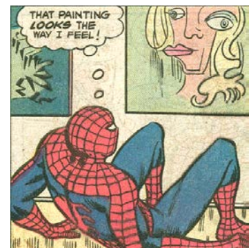
The Amazing Spider-Man, Issue # unknown