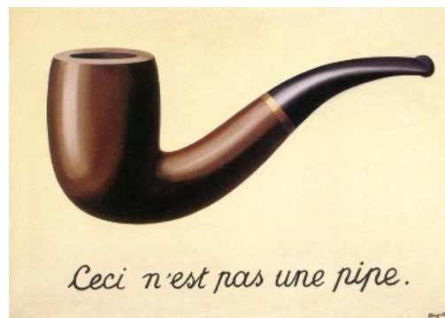
René Magritte The Treachery of Images , 1928