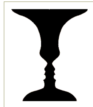
Edgar Rubin Rubin's Vase , 1921

In tandem with the radical reconceptualization of the nature of reality in fields as diverse as painting, linguistics, psychology, music and quantum mechanics, the modernist revolution in poetry sought to forge a poetics of experiment with a poetics of premise. Producing manifestos and defences, founding magazines and collectives, and manoeuvring among both princes and paupers, the agents of this revolution recalibrated the role of poetry as that of purpose and the role of poets as that of philosopher kings.