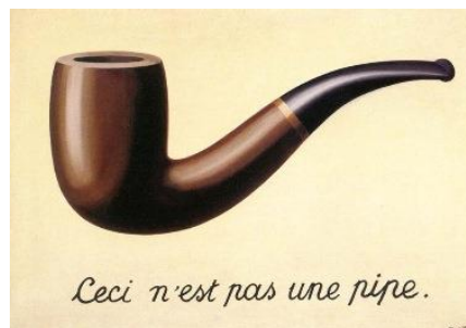
René Magritte The Treachery of Images , 1929